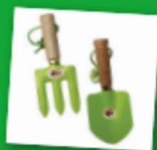
Trowels & Spades