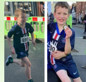
Super Ollie! Alcester Marathon Kids 1k!

Falcons: 38 Hawks: 40 Eagles: 31 Buzzards: 49 Kestrels: 36